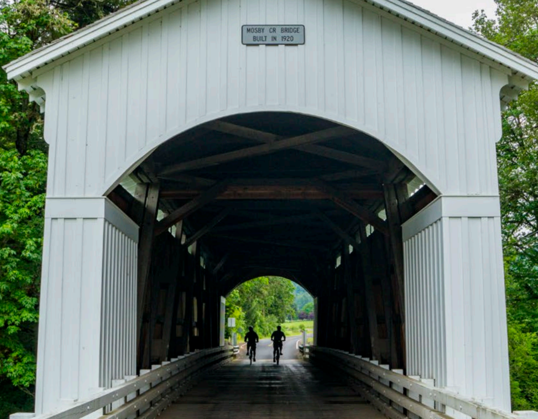
Cottage Grove, Willamette Valley