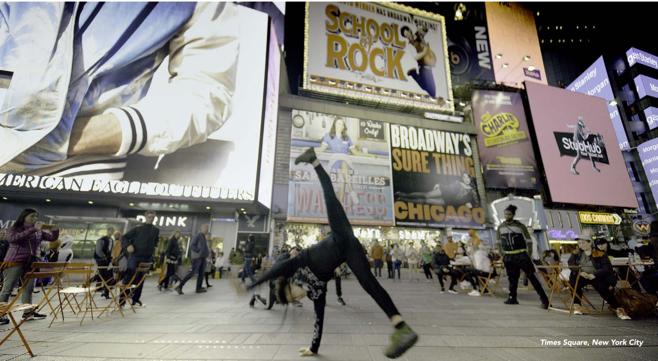
Times Square, New York City