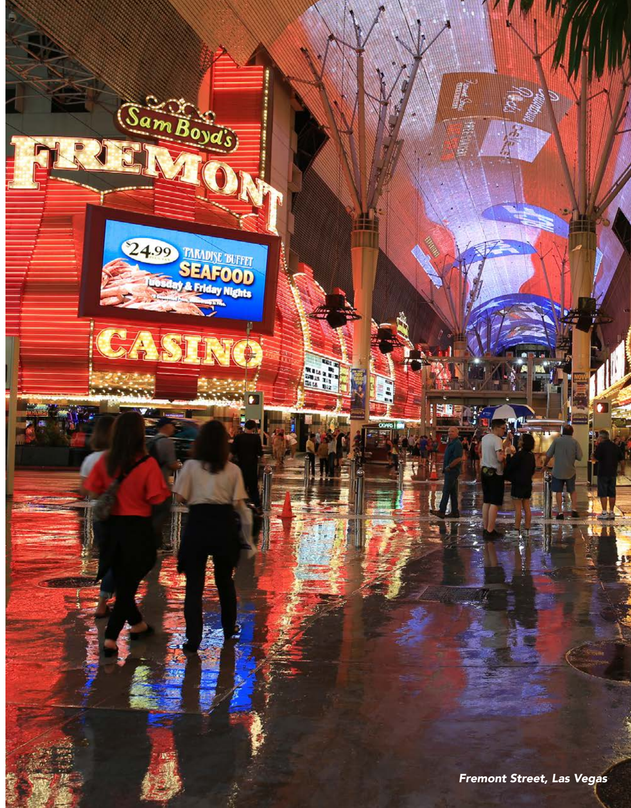
Fremont Street, Las Vegas