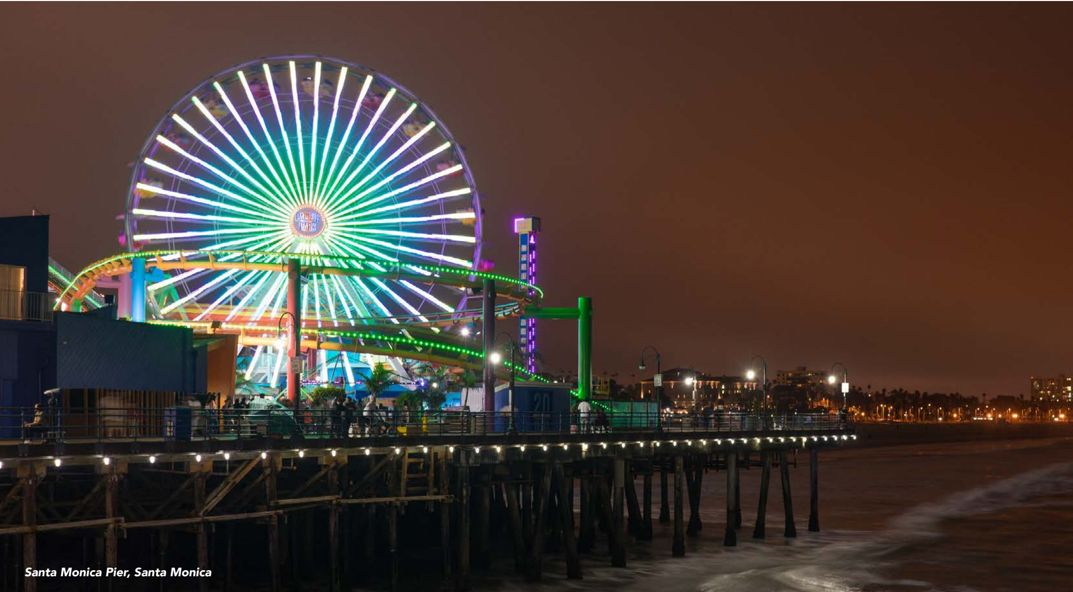
Santa Monica Pier, Santa Monica

the beautiful beach. Heading toward the airport, stop in Santa Monica and visit its famous pier with a carousel – it was the setting for the Looff Hippodrome in "The Sting." It's also where Forrest Gump "ran clear to the ocean." Eat lunch before heading to the airport.