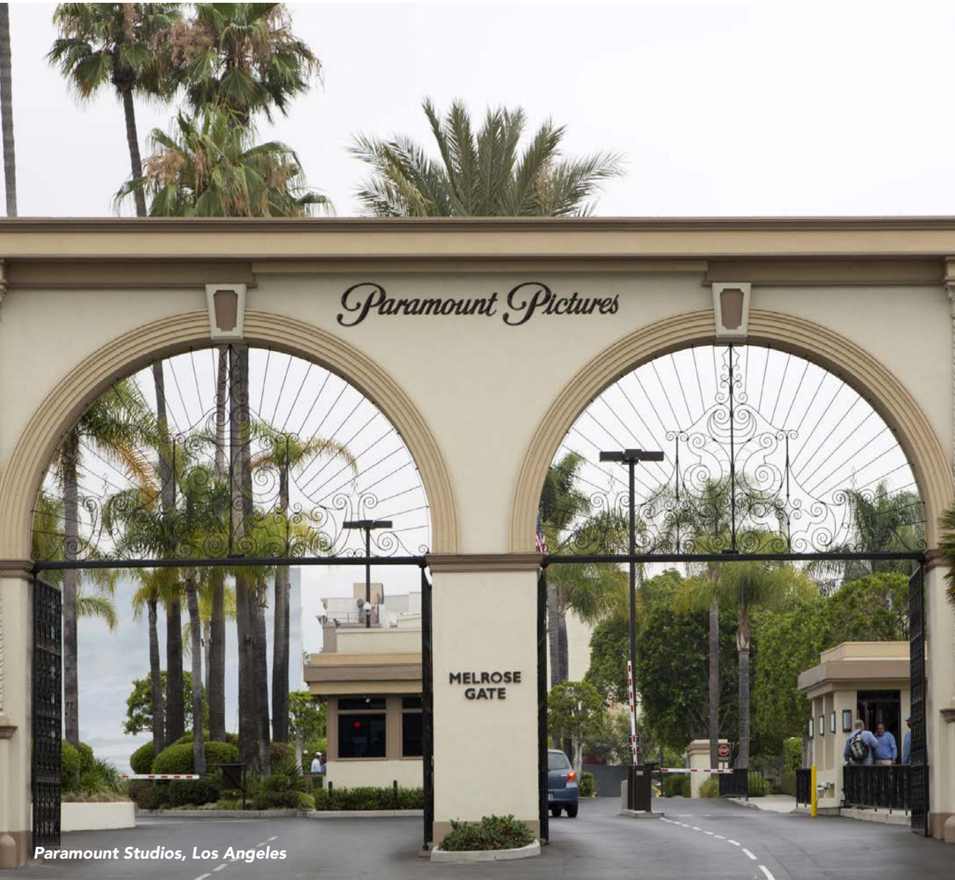
Paramount Studios, Los Angeles

Accommodation: Beverly Hills or West Hollywood, California