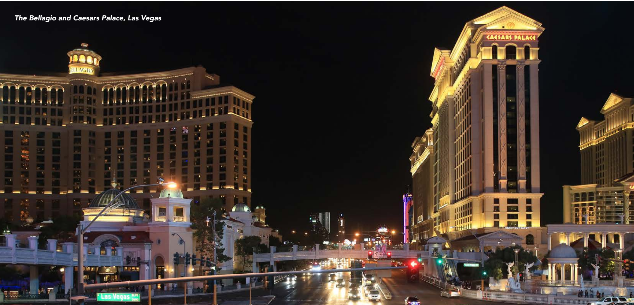
The Bellagio and Caesars Palace, Las Vegas