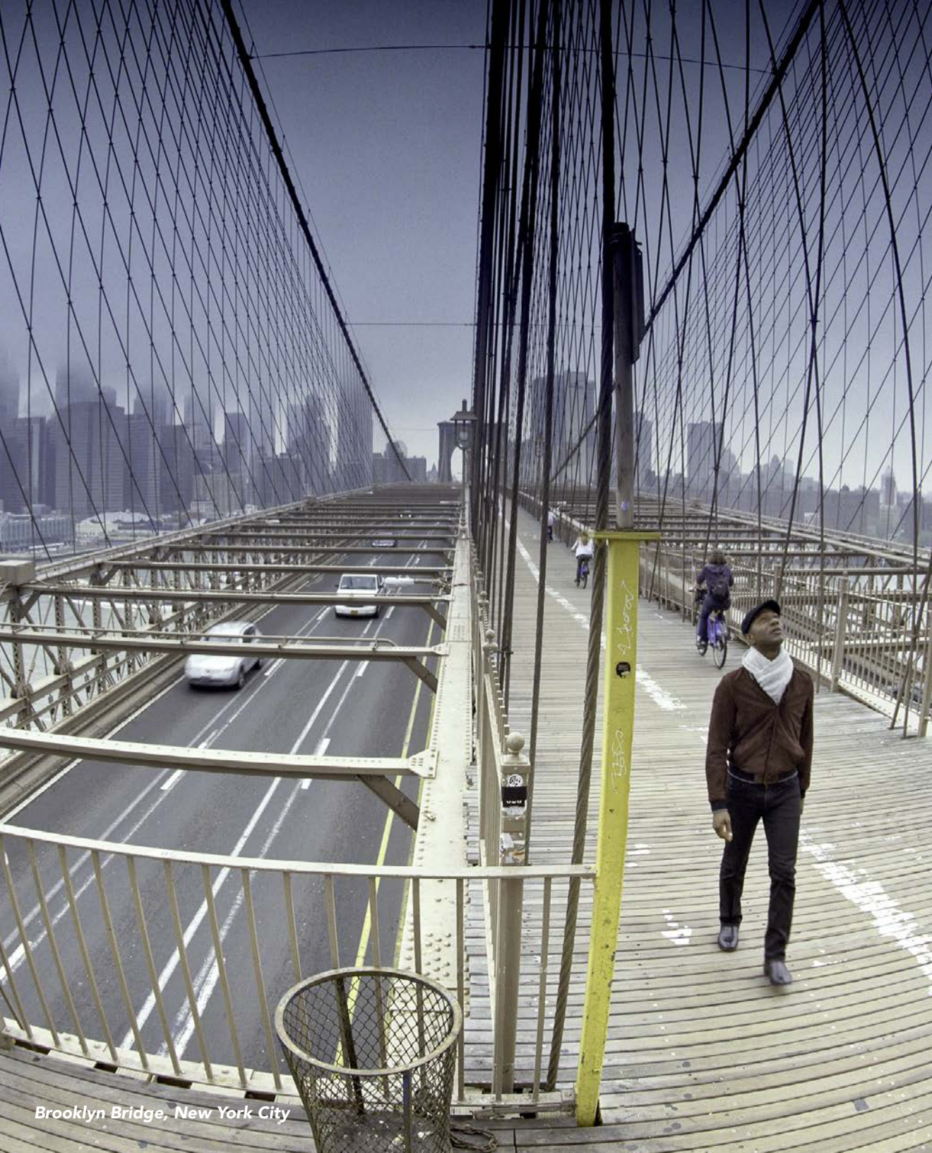
Brooklyn Bridge, New York City