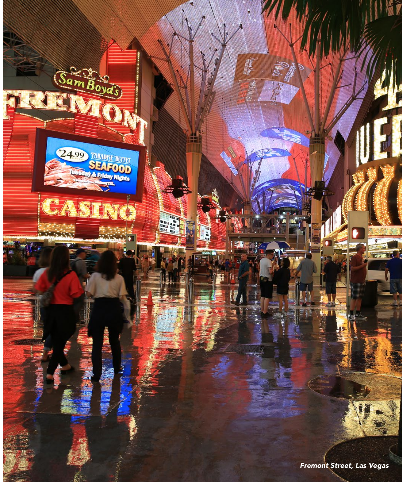
Fremont Street, Las Vegas