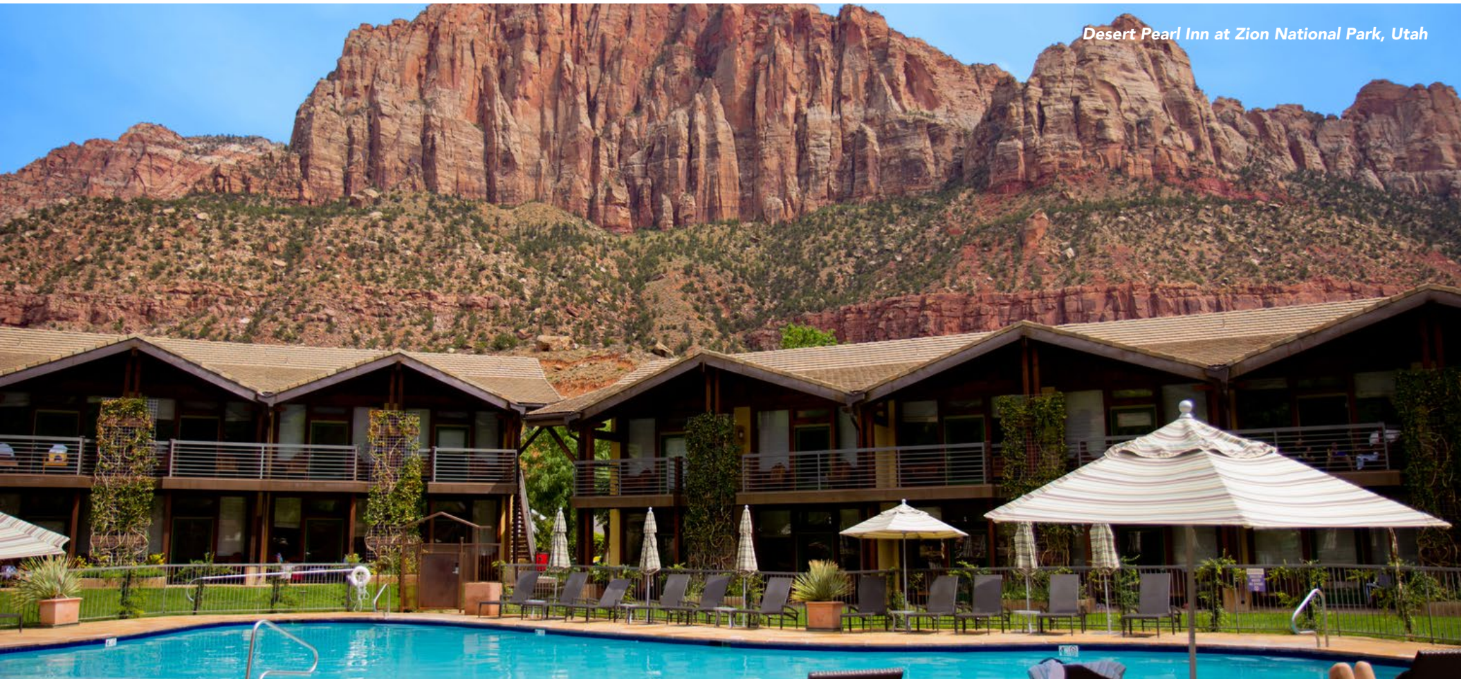
Desert Pearl Inn at Zion National Park, Utah

For more trip inspiration and travel ideas throughout the USA, go to: VisitTheUSA.com