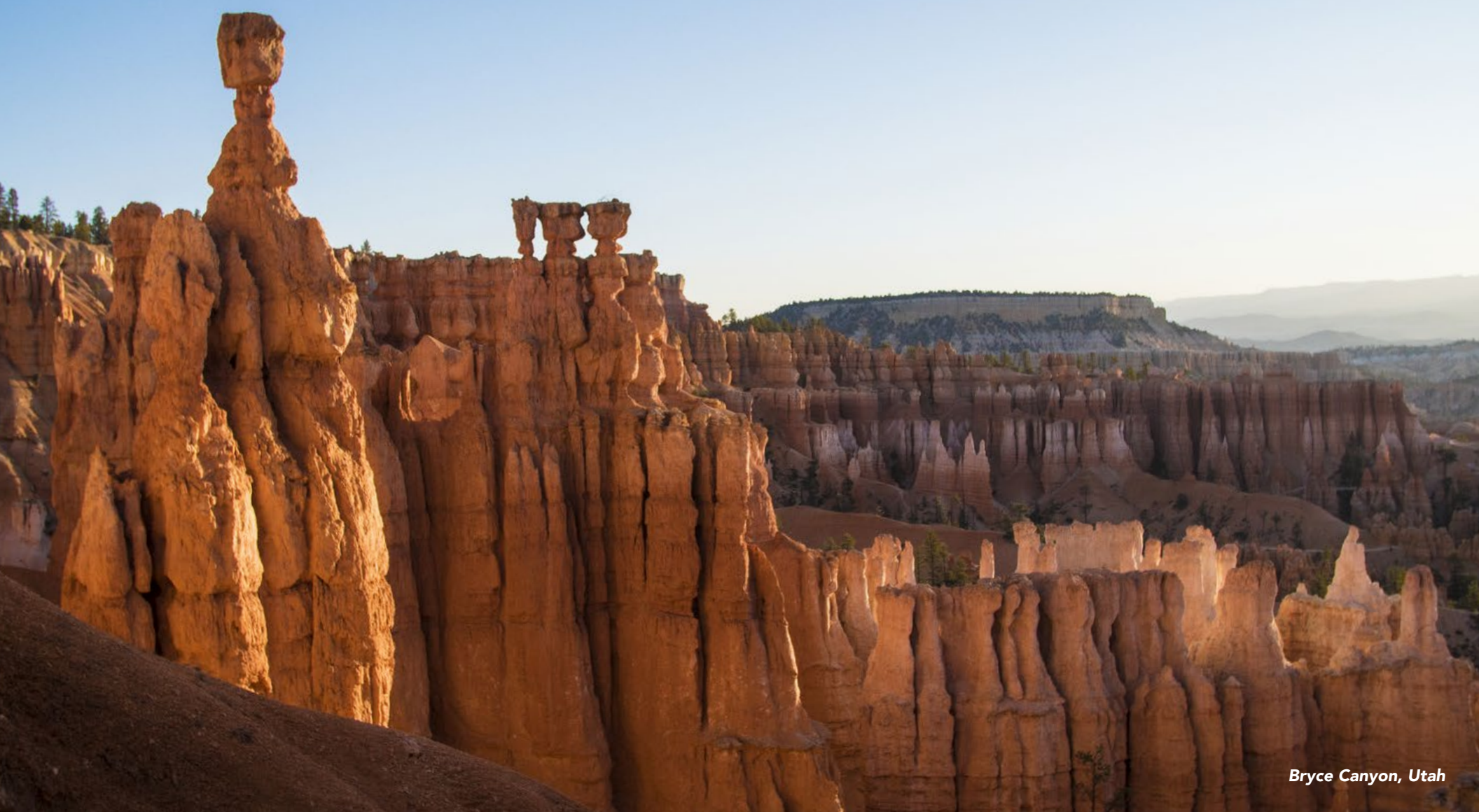
Bryce Canyon, Utah